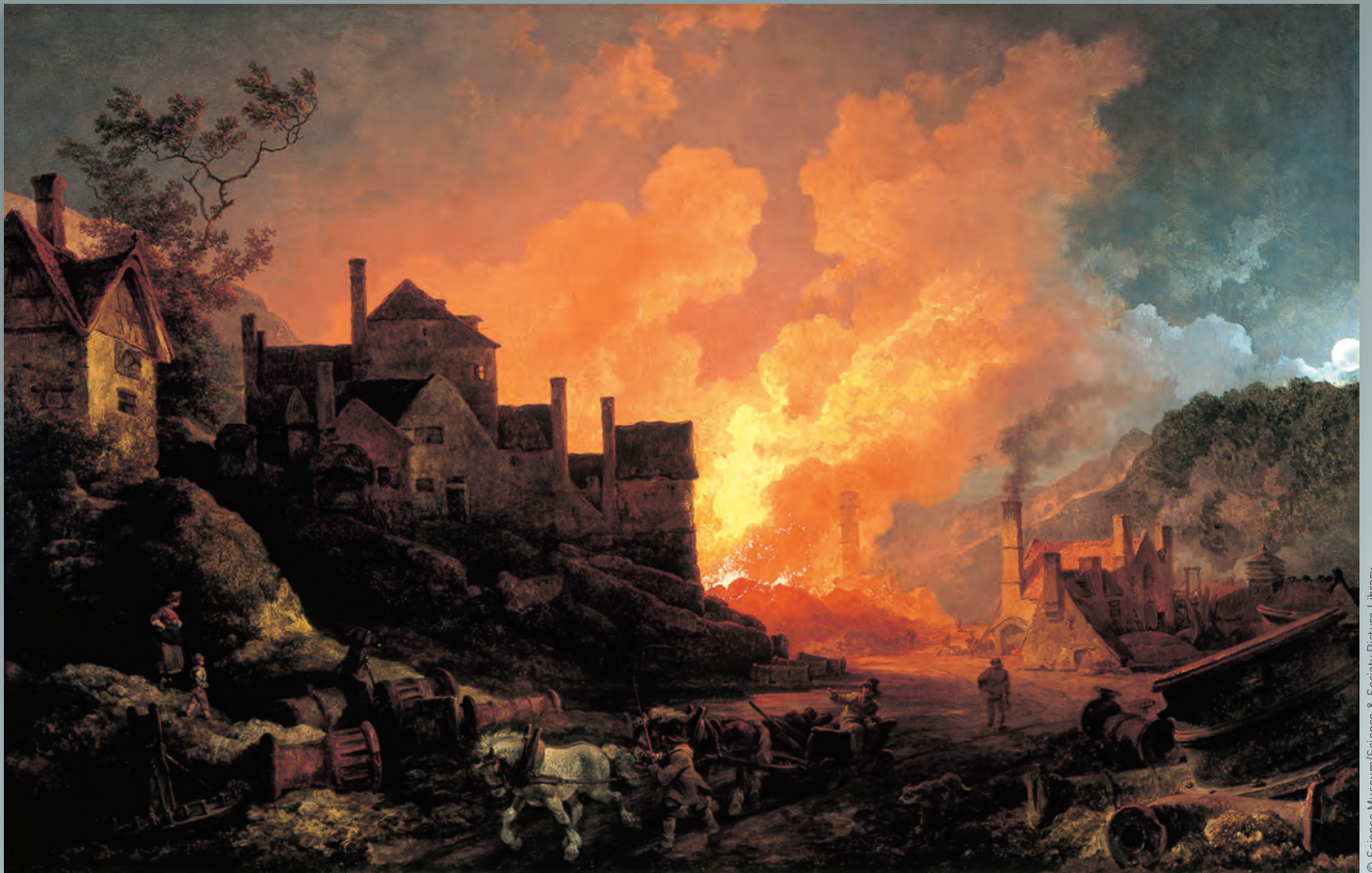
Coalbrookdale by Night, by Philippe Jacques de Loutherbourg, 1801.

Individuals with extraordinary talents were active in Shropshire in the late eighteenth century, but were the contacts between them as fruitful as those between the members of the Lunar Society in Birmingham or the Derby Philosophical Society? Can these networks meaningfully be characterised as a Shropshire Enlightenment?