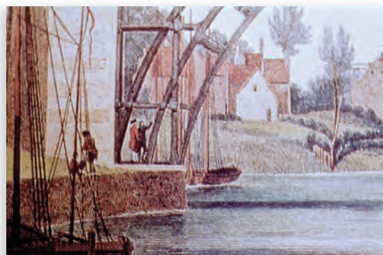
Visitors Inspecting the Iron Bridge, by Michael Angelo Rooker, 1781.