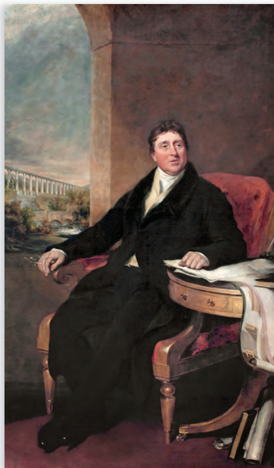
Portrait of Thomas Telford, by Samuel Lane, c. 1822.