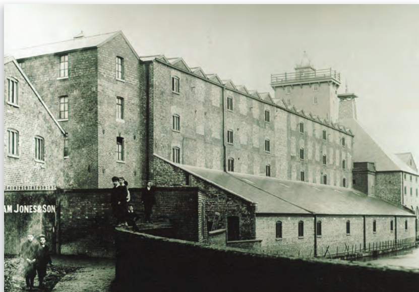
Photograph of Ditherington Flax Mill from the East showing the Shropshire Canal and bridge in the foreground, c. 1900.

The most powerful unifying force within this group was probably not science but opposition to slavery, which provided contacts with such national figures as Thomas Clarkson and William Wilberforce. There was also a wider political context, an apprehension during the 1790s about the war against France and growing political oppression in England.